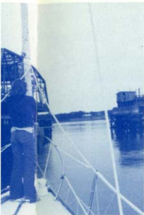
Left — Perry's Creek Above & right — Townsend Gut