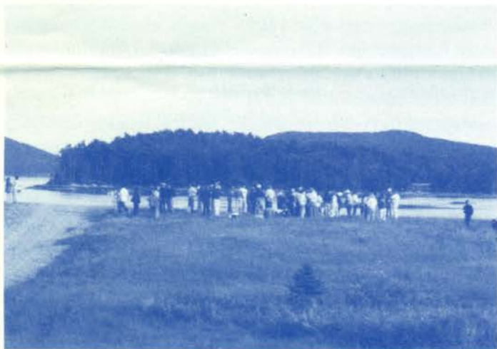
Maine Summer Cruise — Somesville

ANNUAL MEETING & FALL BANQUET BLUE WATER SAILING CLUB FANTASIA'S RESTAURANT FRIDAY, NOVEMBER 17, 1978 1800 HOURS