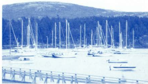
Left & above — Somesville